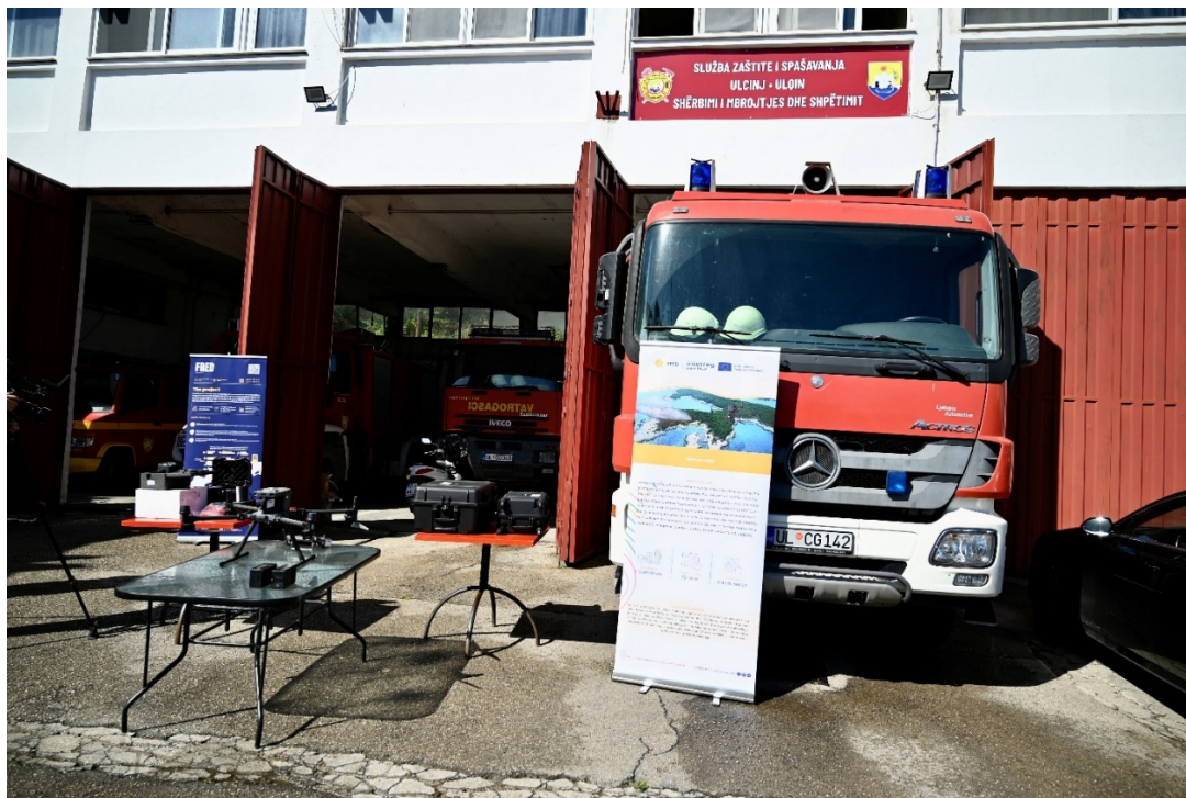
Figure 12: The purchased UAV and auxiliary equipment