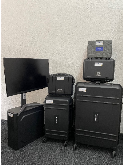
Figure 10: Purchased Equipment (PC and UAS)