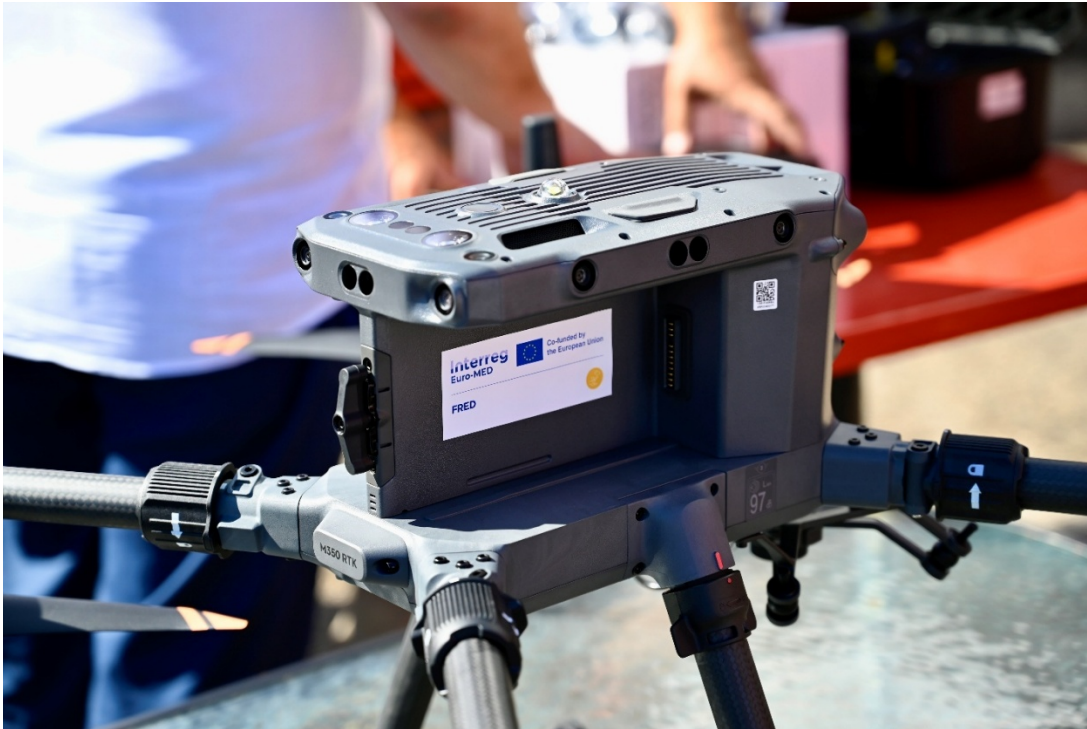
Figure 13: The purchased UAV with the sticker