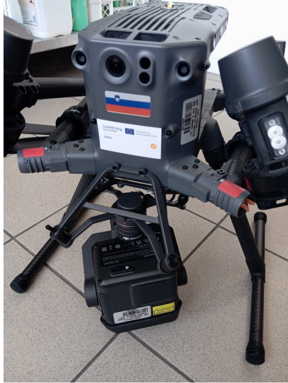
Figure 1: The purchased UAV and auxiliary equipment with sticker