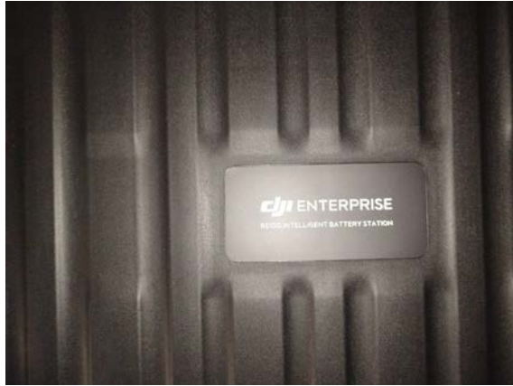
Figure 18: DJI Enterprise BS100 Intelligent battery station