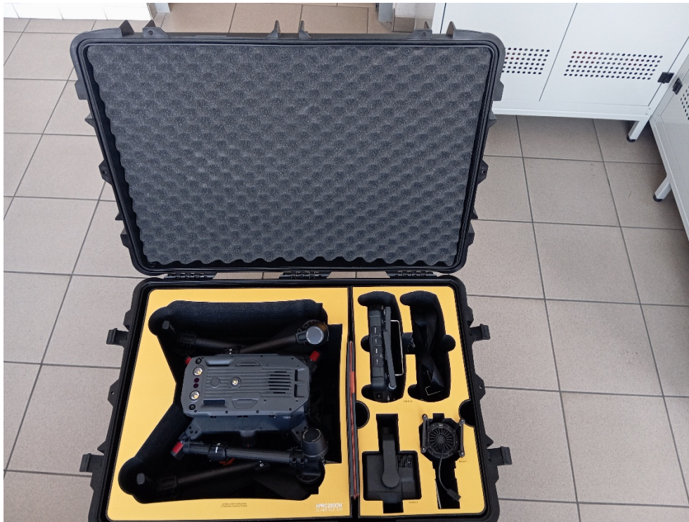
Figure 2: UAV in suitcase with equipment