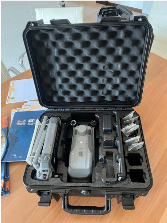
Figures 8: The purchased UAV