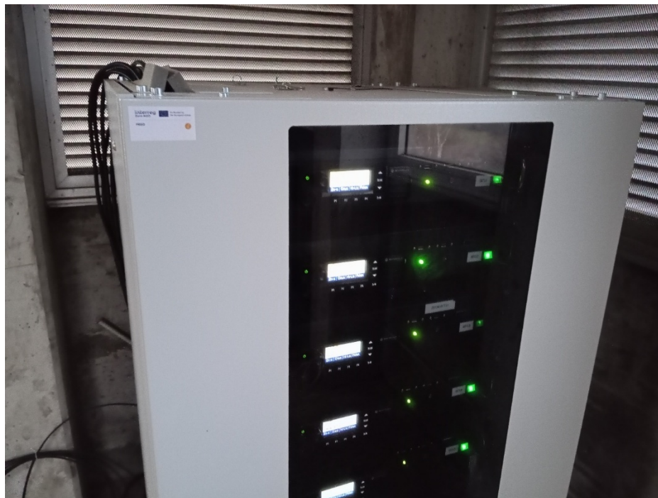
Figure 6: TK cabinet