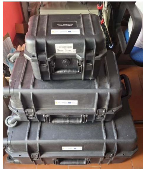
Figure 28: The purchased UAV