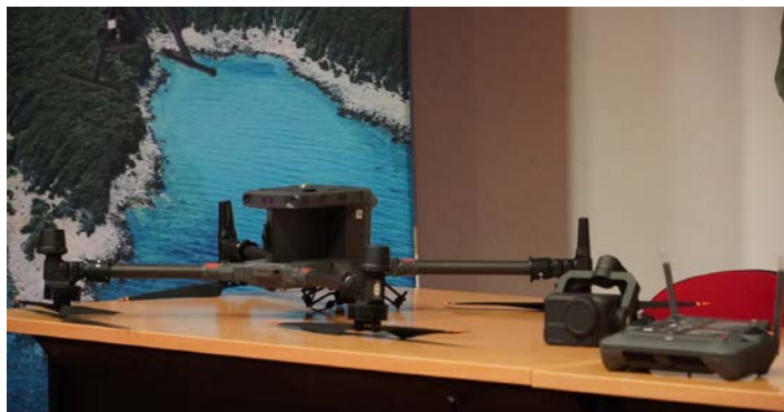
Figure 27: The purchased UAV