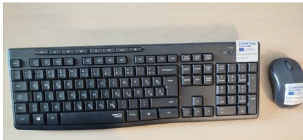
Figure 24: Equipment with stickers

All purchased equipment bears stickers displaying the project name, the EU flag, and a statement that the project is co-funded by the European Union.