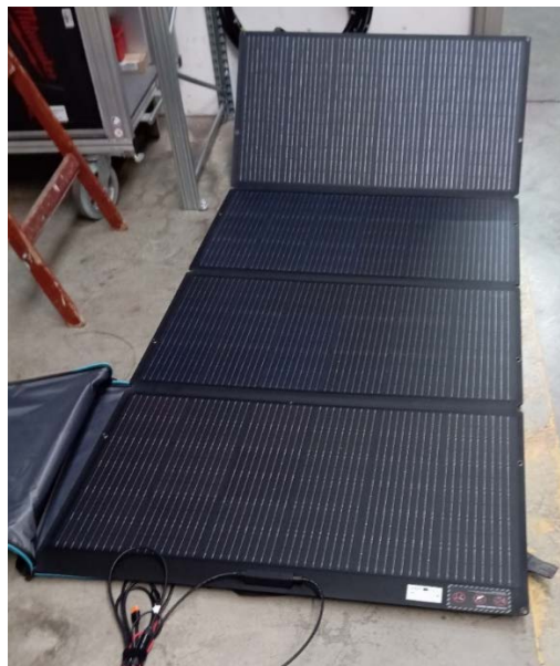
Figure 4: Solar panel for ECOFLOW