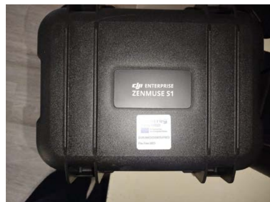
Figure 17: DJI Zenmuse S1