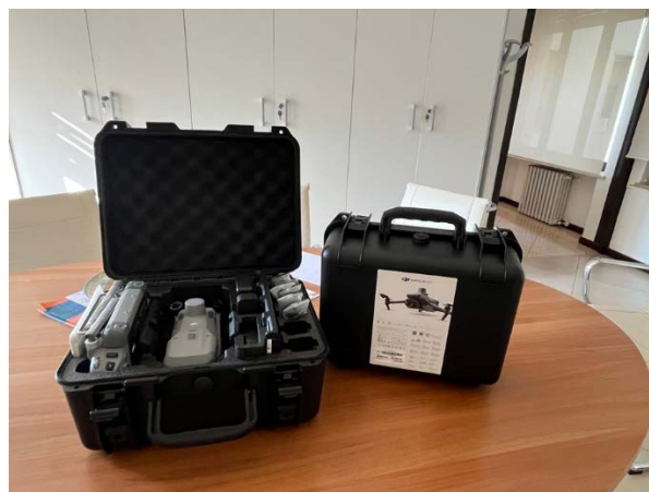
Figures 7: The purchased UAVs