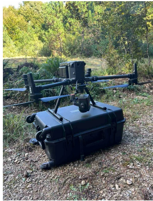
Figure 11: Purchased UAS