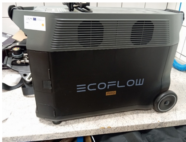
Figure 3: Battery ECOFLOW

All equipment is marked with the project label, the EU emblem and a statement of EU co-funding.