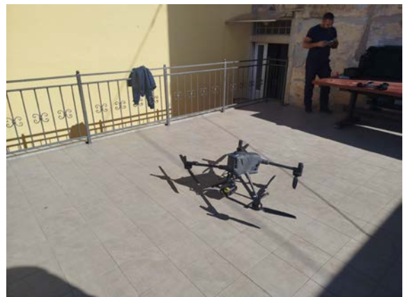
Figure 23: Testing the UAV