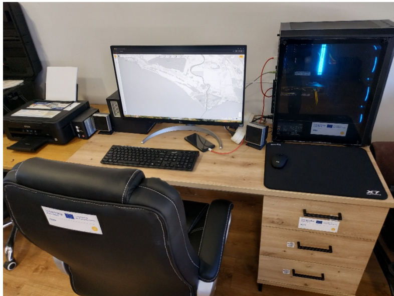
Figure 14: Workstation equipment and furniture

The procurement budget for workstation equipment was 2,300.00 EUR. The total value of the contracts was 2,198.10 EUR.