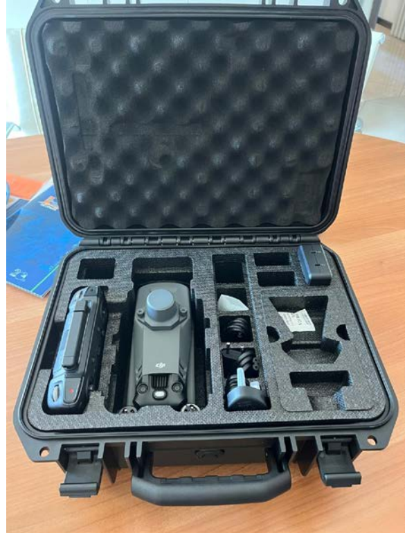
Figures 9: The purchased UAV