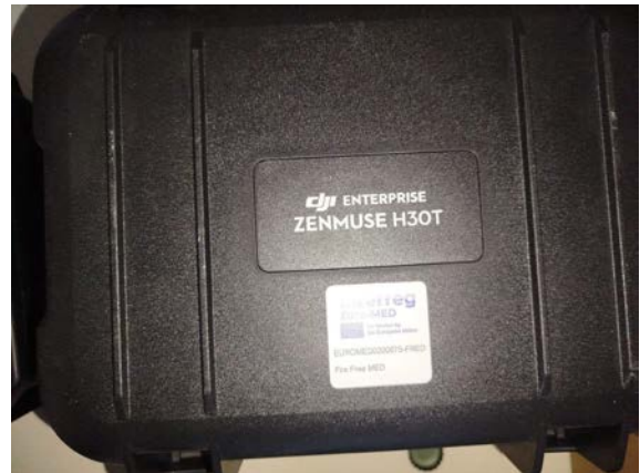
Figure 21: DJI Zenmuse H30T