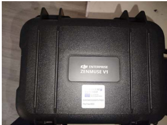
Figure 20: DJI Zenmuse V1