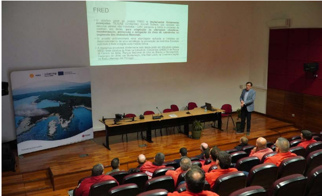
Figure 26: Presentation of the purchased UAV