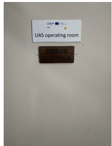
Figure 15: Workstation door sticker/plaque