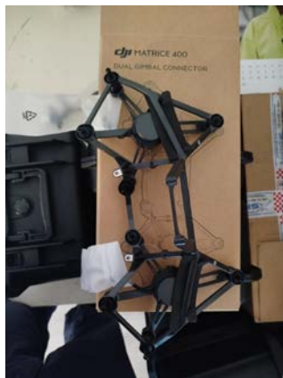
Figure 16: Dual gimbal connector