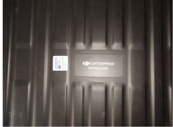
Figure 19: The purchased UAV