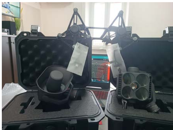
Figure 22: DJI Zenmuse V1 and S1