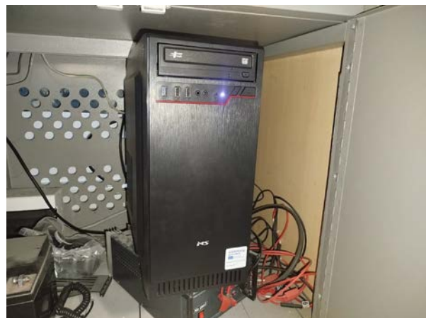
Figure 25: Equipment with stickers